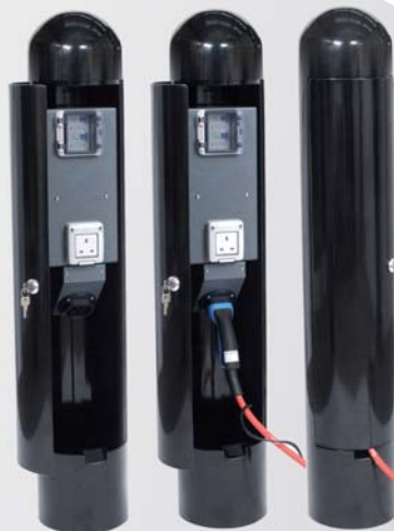
Curved Top version