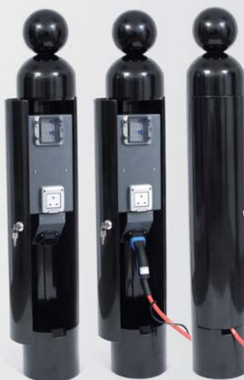
Ball Top version